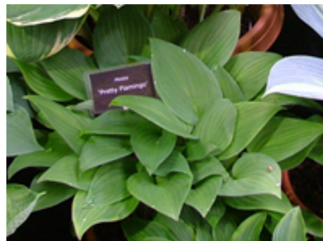
H. 'Pretty Flamingo'

It preceded today's red-stemmed cultivars and was named for its' pink stems and the flower bud, which resembles a birds head. It is a compact plant with neat mid-green leaves and has been popular with customers.