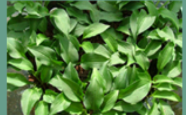
H. 'Paradise Puppet'

Some varieties struggle to establish but some are excellent growers. The following cultivars from h. venusta , are not only favourites of ours they are also highly popular with customers and collectors: