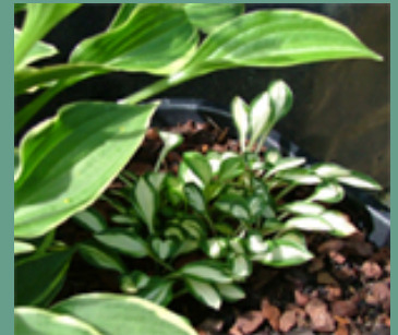
H. 'Cat's Eye'