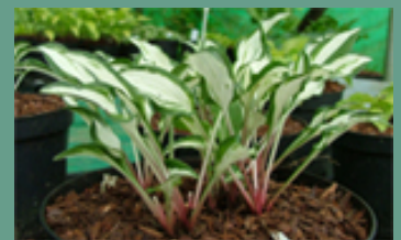
H. 'Lakeside Elfin Fire'