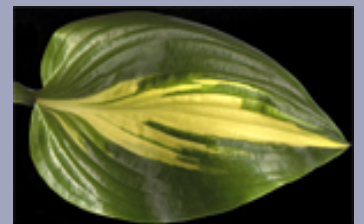
H. 'American Sweetheart'

This year the following cultivars have proved very popular: