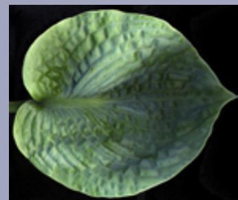
H. 'Love Pat'