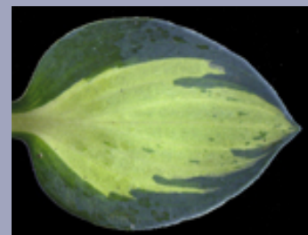
H. 'Holy Mouse Ears'