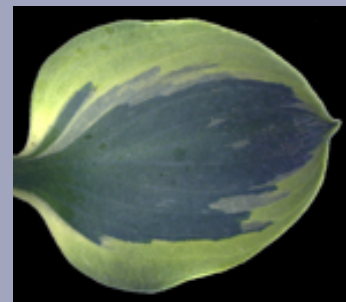
H. 'Frosted Mouse Ears'