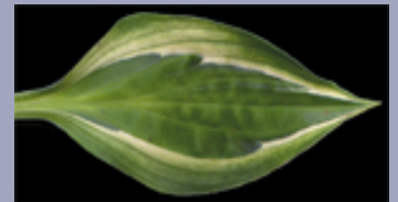
H. 'Hanky Panky'

And we hope to have more h. 'Kiwi Full Monty' available for sale in 2010: