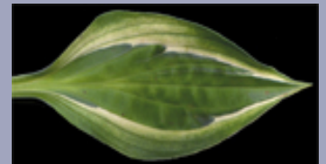
H. 'Hanky Panky'

And we hope to have more h. 'Kiwi Full Monty' available for sale in 2010: