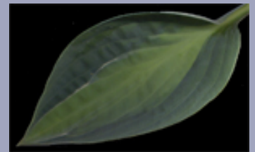
H. 'Kiwi Full Monty'

And we hope to have more h. 'Kiwi Full Monty' available for sale in 2010: