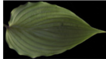
H. 'Gunsmoke' (2000)