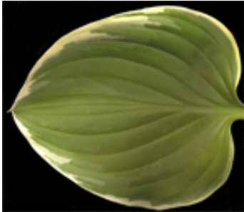
H. 'Clifford's Forest Fire' (2000)