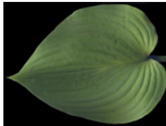
H. 'Hercules' (NR)