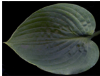
H. 'Kiwi Skyscraper' (NR)