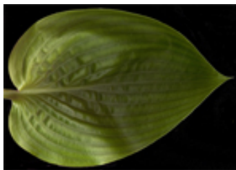
H. 'Devon Hills' (NR)