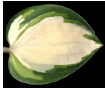
H. 'Lonesome Dove' (2005)