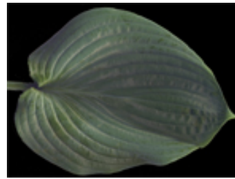
H. 'Blue Hawaii' (1999)