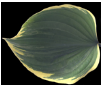
H. 'Ivory Coast' (1999)