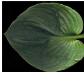
H. 'Millennium' (1995)