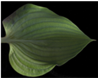
H. 'Emerald Emperor' (NR)