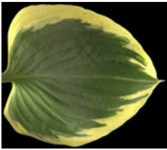
H. 'Majesty' (1999)