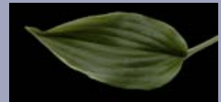
H. 'Kifukurin Ubatake'