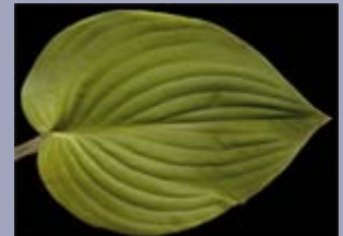
H. 'Golden Medallion'