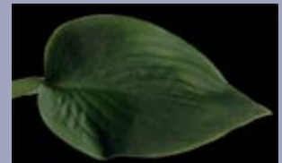
H. 'Sea Lotus Leaf'