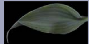
H. 'Hadspen Heron'