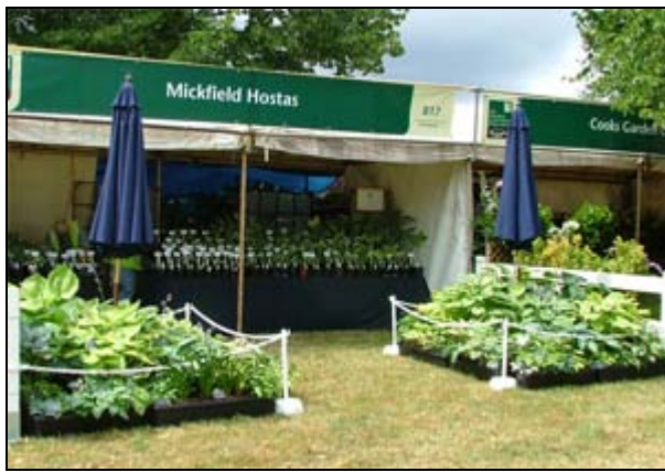
Our 2008 Hampton Court Plant Mall exhibit

The recent explosion on the number of miniature varieties has resulted in a large number of people focusing their collections on the smallest hostas. On the other end of the scale we know quite a few collectors who specialise in large/giant leaved varieties and this year there are some fabulous cultivars coming on to the market. Apparently h. 'Jurassic Park' doesn't suffer any pest problems - read this entertaining description and you will understand why.