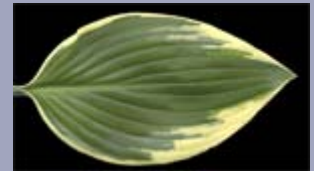
H. 'Abiqua Recluse'

As the temperature in the tunnels warms up we have been busy dividing. The following cultivars have just been added to our availability list: