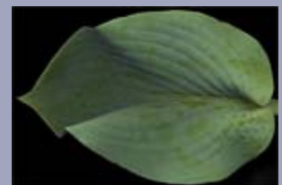
H. 'Blue Seer'