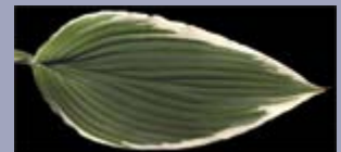
H. 'Mountain Snow'