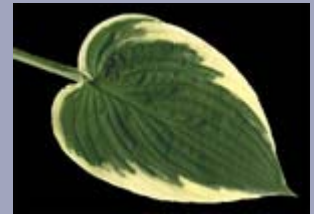
H. 'Fringe Benefit'