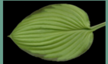
6. h. 'Gold Standard'