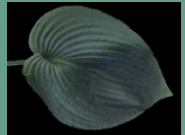
2. h. 'Abiqua Drinking Gourd'