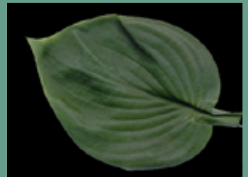
8. h. 'Blue Cadet'