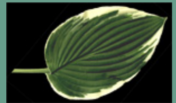
3. h. 'Francee'