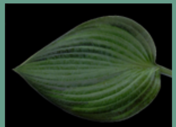
10. h. 'June'

The advice and opinions contained within this monthly newsletter have been formed over more than 30 years of experience with the Hosta genus. We are constantly learning and refining that knowledge and would welcome any suggestions that readers of this newsletter would like to make so please contact us .