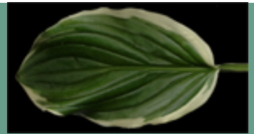
5. h. 'So Sweet'