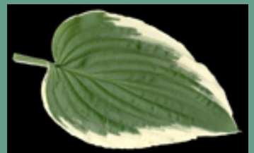
9. h. 'Fortunei Moerheim'