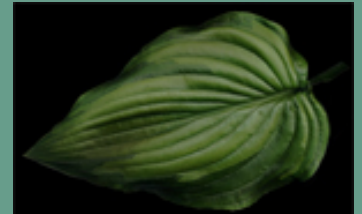
1. h. 'Fortunei Albopicta'