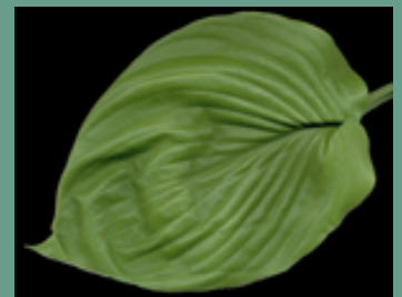
4. h. 'Sum and Substance'