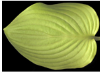
H. 'Fried Green Tomatoes'