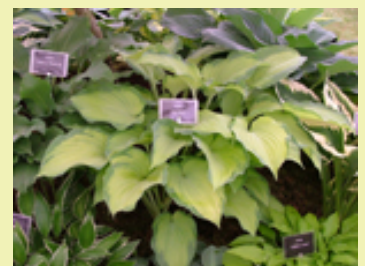
h. 'Old Glory'

But the stars of the show were the hostas, including: