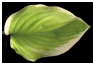
H. 'Frozen Margarita'