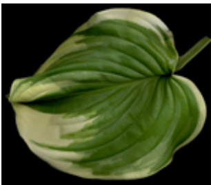
H. 'Fragrant Dream'