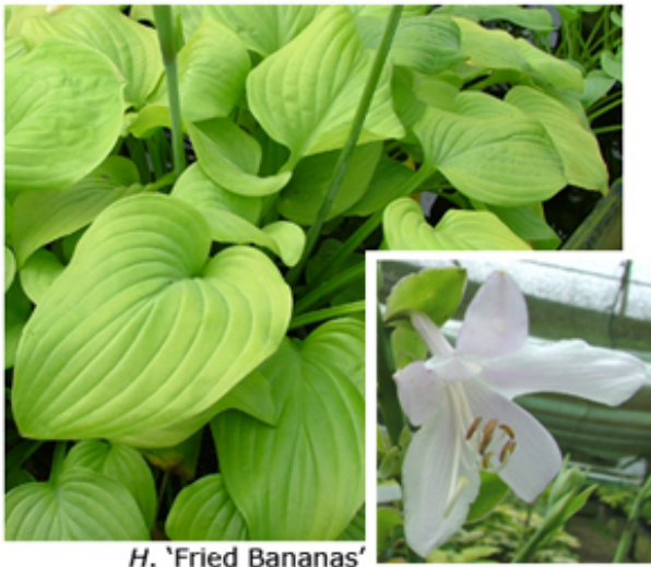
H. 'Fried Bananas'

The best garden situation for fragrant varieties is a spot where the plant will catch the late afternoon sun and experience more reflected warmth.