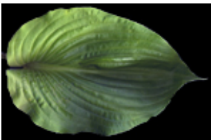
H. 'Essence of Summer'

We plan to feature the following fragrant cultivars in our Floral Marquee display: