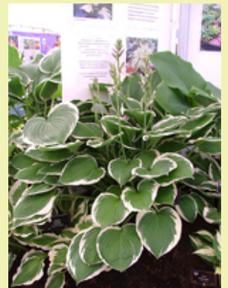
H. 'Francee' looking fab (click on image to view)

The Plant Heritage Marquee was organised around the theme of 'The Living Library of Garden Plants' and was very well received by visitors to the show. We thoroughly enjoyed exhibiting alongside the other National Collections featured in the marquee and, as ever, it was great to be able to spend some time answering questions and enthusing visitors about hostas and plant collecting in general.