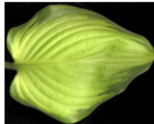
H. 'Stained Glass'