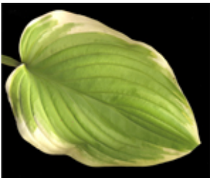
H. 'Fragrant Bouquet'