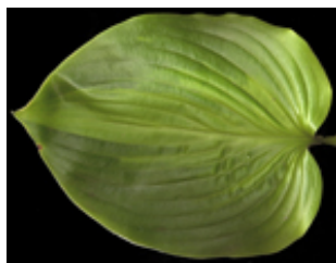
H. 'Holy Mole'