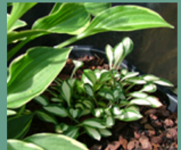
H. 'Cat's Eye'