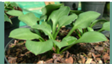
H. 'Green Mouse Ears'