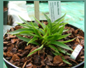
H. 'Radio Waves'

Potential candidates for the bonsai treatment might be: