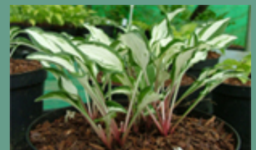
H. 'Lakeside Elfin Fire'