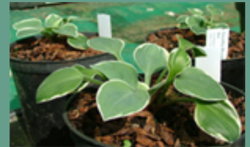
H. 'Country Mouse'