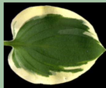
h. 'Lakeside Miss Muffet'