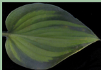
H. 'Tick Tock'