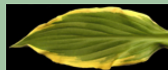
h. 'Mack the Knife'