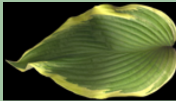
H. 'Amazing Grace'