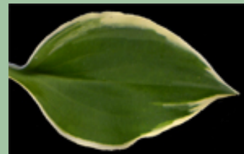
h. 'Lakeside Baby Face'

We expect the miniature varieties to continue to be popular in 2010 and we are pleased to be able to offer four more for sale: