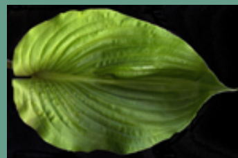
Essence of Summer

Visitors to the Harrogate Autumn Show last year were able to see this lovely new variety in our display.