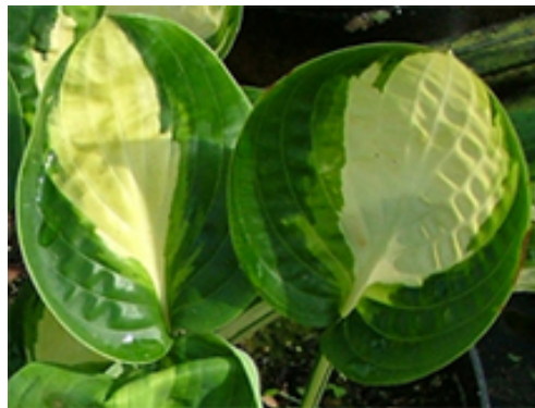
H. 'Warwick Comet'

Both these cultivars have vibrant colouring, what we call 'bling' varieties. They represent one of the most distinctive changes we have seen over the past 20 years, when the most colourful cultivar we had for sale was H. 'June' , although this has certainly stood the test of time in the popularity stakes. It can be difficult to choose between new 'bling' varieties to add to the collection, which is why we always try to select cultivars with something special, aside from being colourful, such as leaf shape, plant habit, texture, etc.