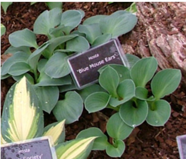
H. 'Blue Mouse Ears'

Although it is probably true that the majority of cultivars currently in existence, were the happy result of mutations through the process of tissue culture, someone has to 'discover' them, and, hopefully, do the research required to establish whether the cultivar already exists, before registering them as identifiably different. The breeder then has the task of naming it.