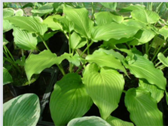
H. 'Hirao Supreme'

Another consequence of the work carried out to identify plants definitively, is that some end up having multiple names associated with them. If you then add to that the modern curse of incorrectly labelled plants at nurseries and shows, more confusion can occur. Plant names are important, why do some varieties sell, whilst others don't, despite looking so very similar? Our experience of selling hostas is that people often go for names they like, or have an affinity with, in preference to the actual characteristics produced. This sometimes seems a little strange, but is as good a pace to start as any.