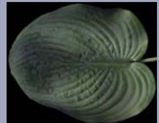
H. 'Blue Mammoth'

Following special requests in 2008, we split a number of giant cultivars. As a result we will have supplies of the following for sale this year: