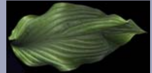
H. 'Krossa Regal' An elegantly tall variety that makes a statement.