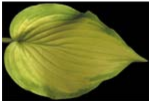
H. 'Old Glory'