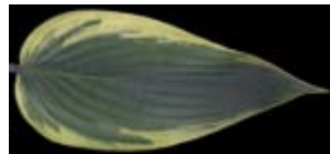
H. 'Mourning Dove'

This small cultivar has wonderfully subtle colouring from the creamy yellow margins through to the smokey blue centres. It was the first variety of the year to sell out.