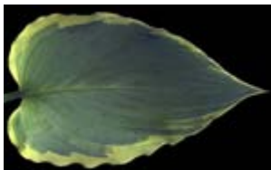
H. 'Déjà Blu'