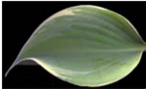
H. 'Blue Flame'

This newsletter contains a list of all the new, and re-introduced, varieties we plan to have for sale in 2009. We had hoped to do a complete listing of all available varieties for 2009, but there isn't enough room! Instead, we have created a PDF of our 2009 catalogue you can download and print off - see here for more details.