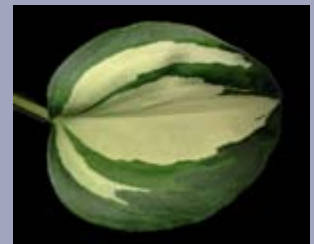
H. 'Thunderbolt' Often requested for its dramatic colouration.

In addition we have very limited supplies of: