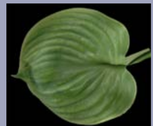
H. 'Lady Isobel Barnett' Another fabulous sport of h. 'Sum and Substance'.