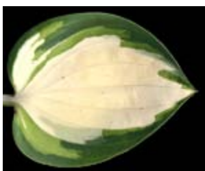
H. 'Lonesome Dove'