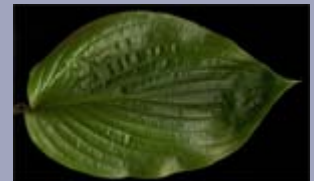
H. 'Potomac Pride' This cultivar really earns its keep as a rich dark, glossy-leaved background to other planting.