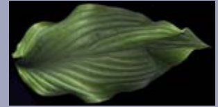
H. 'Krossa Regal' An elegantly tall variety that makes a statement.