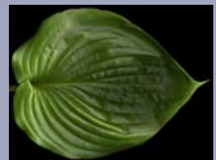
H. 'Domaine de Courson' A fantastic sport of h. 'Sum and Substance'.

A favourite among collectors of giant blues.