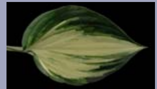
H. 'Pathfinder' A slow grower but a lovely plant once established.