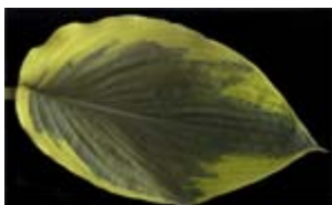
H. 'Great Arrival'