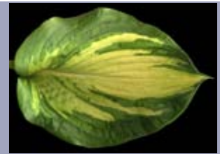
H. 'Great Expectations' An old favourite that is very slow to grow but very much worth the wait.