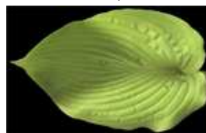
H. 'Kiwi Hippo' Registered cross with H. longipes , 1999