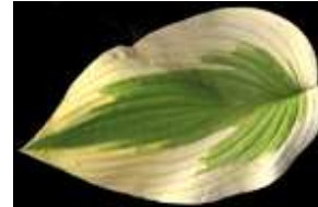
H. 'Merry Sunshine' Registered cross with H. 'Fascination' , 1998