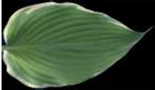
H. 'Arc de Triomphe' Registered cross with H. 'Foxy Doxy' , 2000