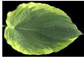
H. 'Celestial' Registered cross with H. 'Dorothy Benedict' , 2000