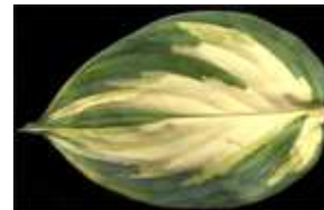
H. 'Ooh La La' Registered cross with H. 'Sea Prize' , 2000

H. hypoleuca is a distinctive species, both in growth and habit. We are awaiting feedback from a couple of our customers, who have purchased plants to grow in rock crevices, to see if they will grow as they do in the wild - watch this space.