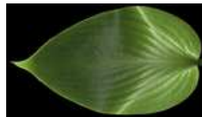
H. 'Gosan Sunproof' Registered cross with H. longipes var. latifolia and H. montana , 2009