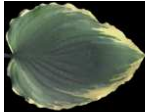
H. 'Lakeside Breaking News' Registered cross with 'LBSR' , 2000