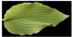
H. 'Azure Snow' Registered hybrid, 1991