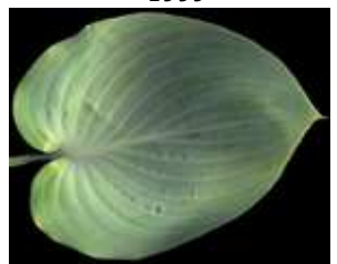
H. 'Bedford Blue' Unregistered cross with H. 'Halcyon'