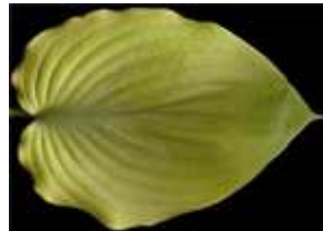
H. 'Lemon Meringue' Registered hybrid, 1991