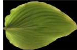
H. 'Maekawa' Registered selection, 2009