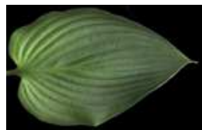
H. 'Elkheart Lake' Unregistered cross with H. 'June'