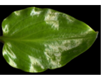
H. 'Red Stepper'