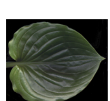
H. 'Slick Willie'