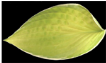
H. 'Academy Fire'

H. 'Academy Fire' is a first generation sport of h. 'Francee'.