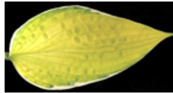
H. 'Patriot's Fire'

H. 'Patriot's Fire' is a second generation sport of h. 'Patriot'.