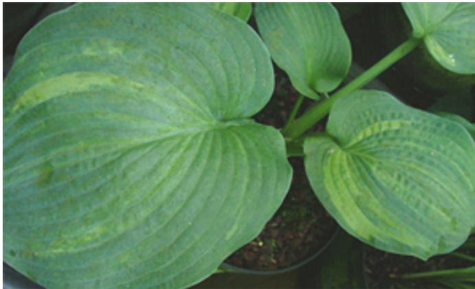
H. 'Dorothy Benedict'

To recap the four key plants, this time in photos: