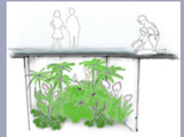
'It's Hard To See' Design in Latitude

Firstly we would like to congratulate Rebecca, Ludovica and Victoria on the success of their first show garden at Hampton Court. The garden was one of only five chosen for its 'avante garde' design to feature at the show: