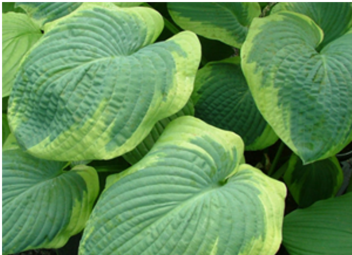
H. 'Frances Williams'