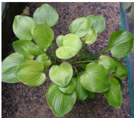
H. 'Academy Flaxen Spades'

Academy Galadriel Academy Gilded Dawn Academy Glowing Embers Academy Gold Codswallop