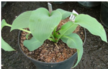
H. 'Academy Celeborn'

In his article 'The Grandchildren of hosta 'Ginko Craig', which was published in Volume 33, Number 2, he discusses some surprising results from experiments with open pollinated seedlings of h. 'Ginko Craig' . This programme was born out of the desire to find interesting flowers, rather than new variations in leaf shapes and colours. It is well worth a read if you are keen to take the subject further.