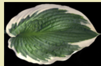
H. 'Barbara Ann'