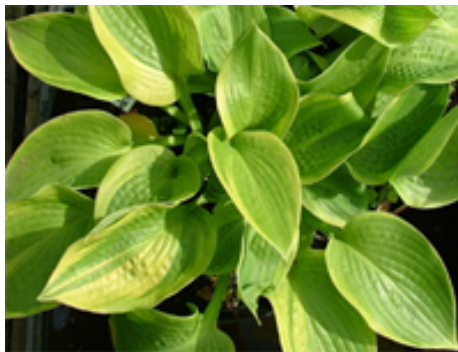
H. 'Academy Blushing Recluse'