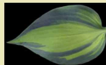
H. 'Touch of Class'

As ever, we are happy to advise on varieties you may wish to buy - don't hesitate to talk to us in person, via phone or email, in the usual way.