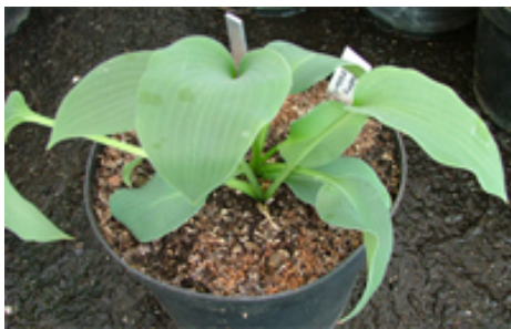
H. 'Academy Celeborn'

In his article 'The Grandchildren of hosta 'Ginko Craig', which was published in Volume 33, Number 2, he discusses some surprising results from experiments with open pollinated seedlings of h. 'Ginko Craig' . This programme was born out of the desire to find interesting flowers, rather than new variations in leaf shapes and colours. It is well worth a read if you are keen to take the subject further.