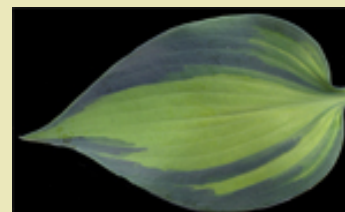
H. 'Touch of Class'

As ever, we are happy to advise on varieties you may wish to buy - don't hesitate to talk to us in person, via phone or email, in the usual way.