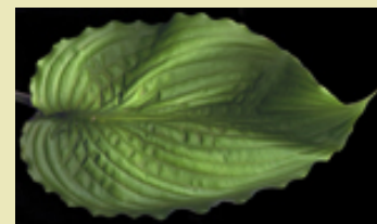
H. 'Niagara Falls'