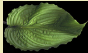
H. 'Niagara Falls'