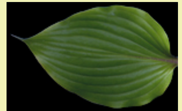
h. 'One Man's Treasure' Deep burgundy petioles and dark green leaves