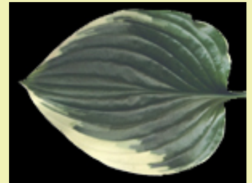
h. 'Torchlight' Upright red stems

The advice and opinions contained within this monthly newsletter have been formed over more than 35 years of experience with the Hosta genus. We are constantly learning and refining that knowledge and would welcome any suggestions that readers of this newsletter would like to make so please contact us .