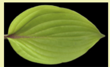
h. 'Fire Island'