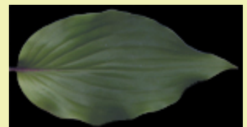
h. 'Harry van de Laar'

Intense red stems with pale green leaves