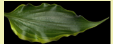
h. 'Raspberries and Cream' Striking petioles & flowers