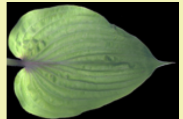
h. 'Purple Haze' Smokey purple haze spreads up into leaves