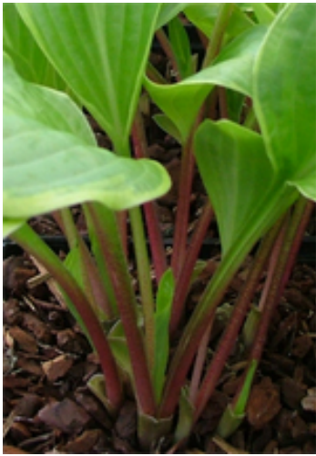
h. 'Bedford Rise and Shine' Cherry Tart Chopsticks

This year we have another clutch of red-stemmed varieties to add to our ever-growing list, including: