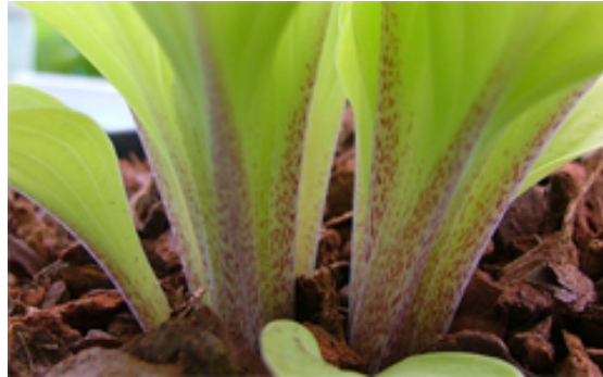
h. 'Coconut Custard' h. 'Ebony Towers' h. 'Fruit Punch' h. 'Marrakech' h. 'Purple Haze' h. 'Scallion Pancakes' h. 'Tickle Me Pink'

A more recent trend is for cultivars with deeper smokey purple petioles, such as h. 'Peacock Strut' and h. 'Purple Haze', which has a subtle tinge of purple extending into the leaf.