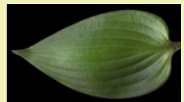
h. 'Miss Ruby'

Intense red stems with pale green leaves