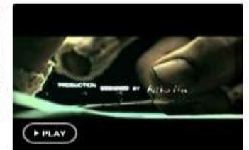
Se7en - Opening Titles - YouTube beautifully shot, quick editing and seems quite experimental