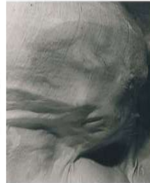
Erwin Blumenfeld Wet Silk, Paris 1937