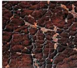
Cornelia Parker, Marks made by Freud, Subconsciously (macrophotograph of the seat of Freud's chair), 2000