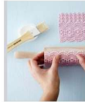
print with lace