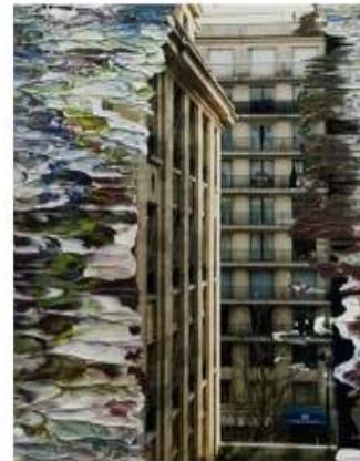
Gerhard Richter : Overpainted Photographs