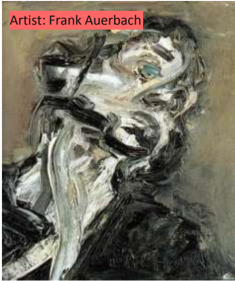
Artist: Frank Auerbach

ARTISTS AND INSPIRATION: Appearance and tactile surfaces