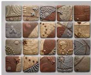
Chris Gryder ceramic tiles