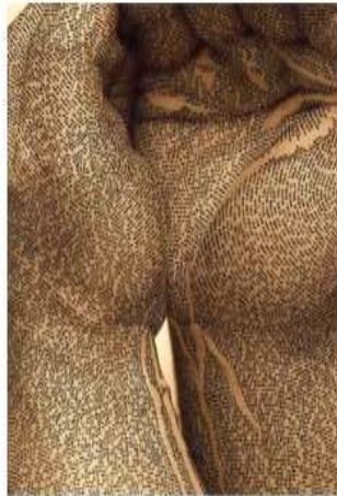
body scripture II by Ronit Bigal (2010)