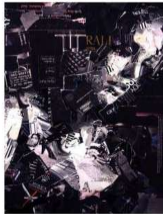
by Derek Gores #collage ( made from recycled magazine )