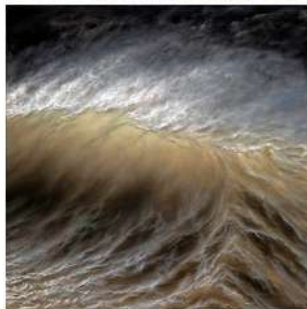
Ran Ortner - Swell, 2006 - oil on canvas Really great use of dimension and texture. Great for