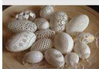
Egg shell sculpture