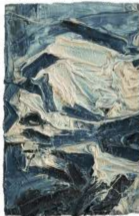
FRANK AUERBACH B. 1931 E.O.W., 1972 oil on board 10 x 6 inches 25.4 x 15.2 cm