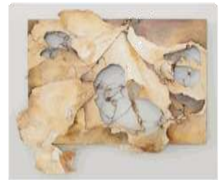
Holding It Together