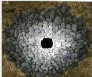
Andy Goldsworthy chance, tactile, cover, decay, crumble, balance, crack, tension, decompose, decrepit, shiver, conjoin, stem, time, echo