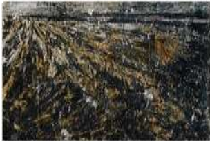
anselm kiefer - Google Search