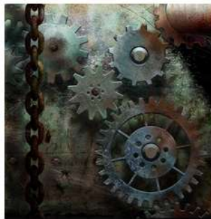
Rusty chain and cogs