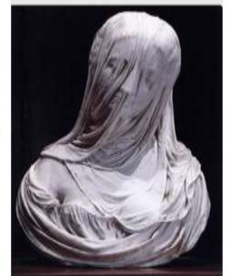
Antonio Corradini, Bust of a Veiled Woman (Puritas), 1717-25.