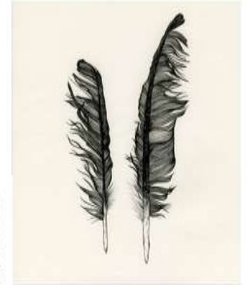
Selected works by claire scully