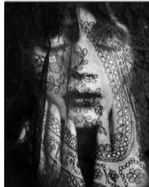
La Belle Otéro