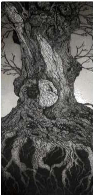
Blaze Cyan - Emile Knoke - Etching