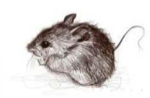
SKETCHES