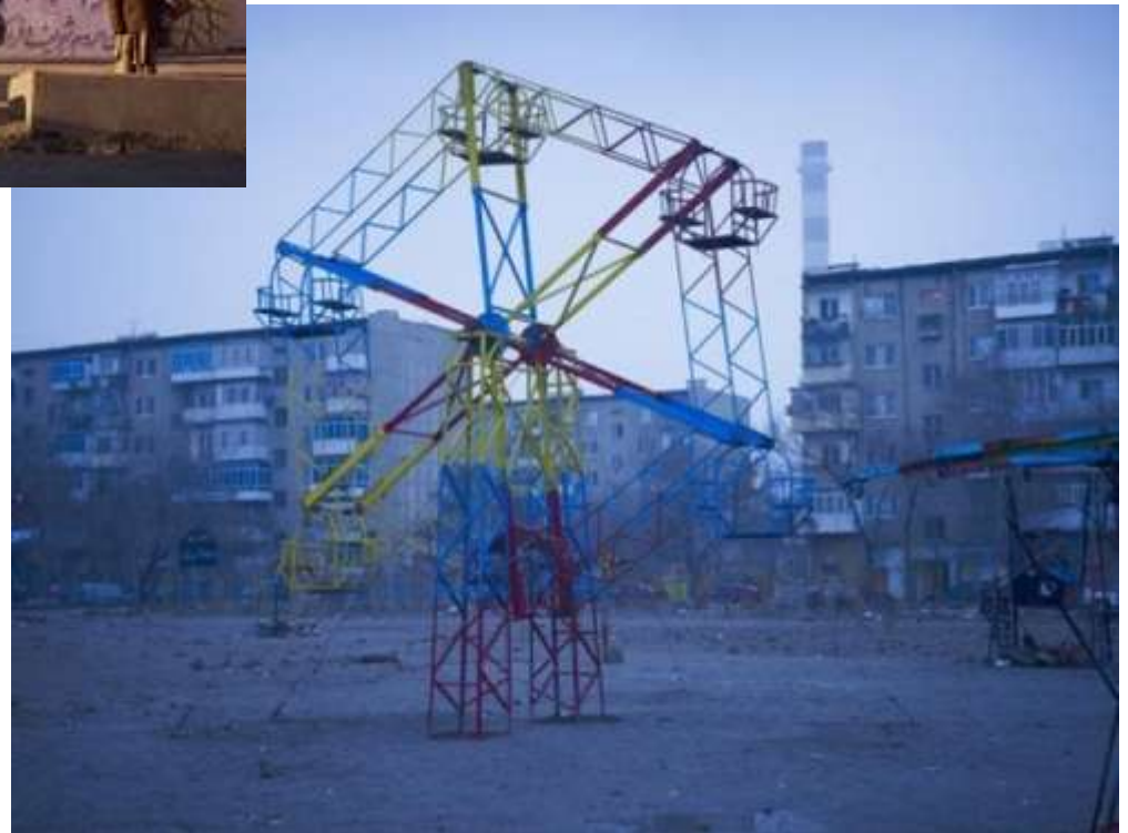
Norfolk- Ferris wheel in Afganistan