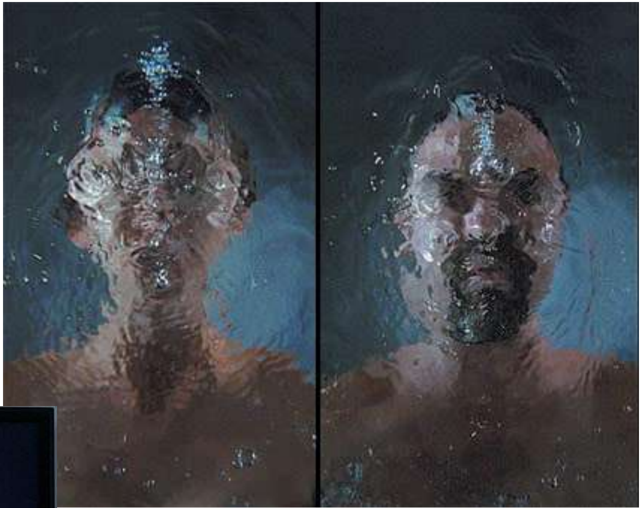
Bill Viola- dissolution 2005