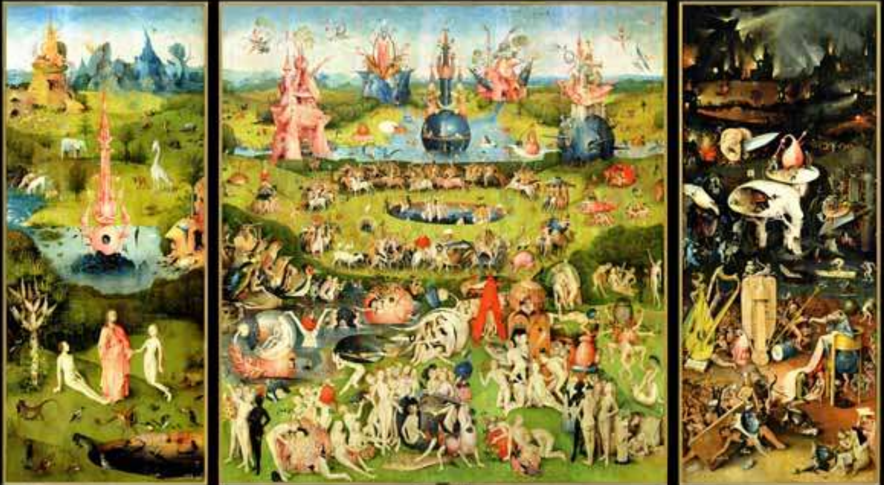
The Garden of Earthly Delights- Hieronymus Bosch 1510-15