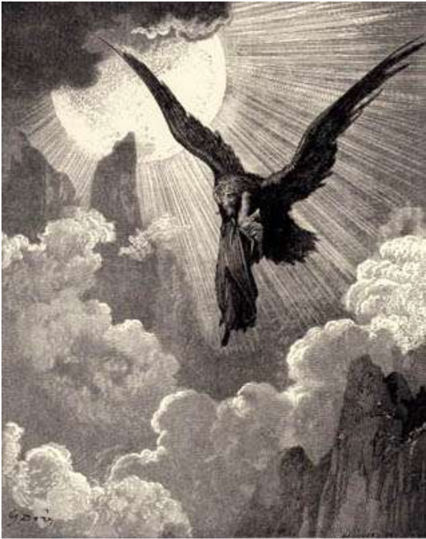
Gustav Dore- Dante Carried away by an Eagle