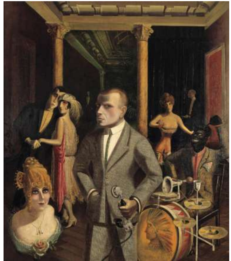
Otto Dix- 1922- To Beauty