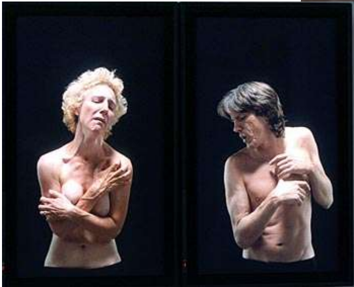
Bill Viola- Union 2000