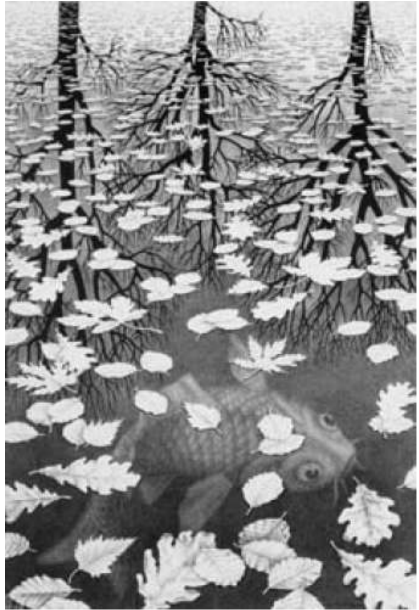
M C Escher- Three Worlds