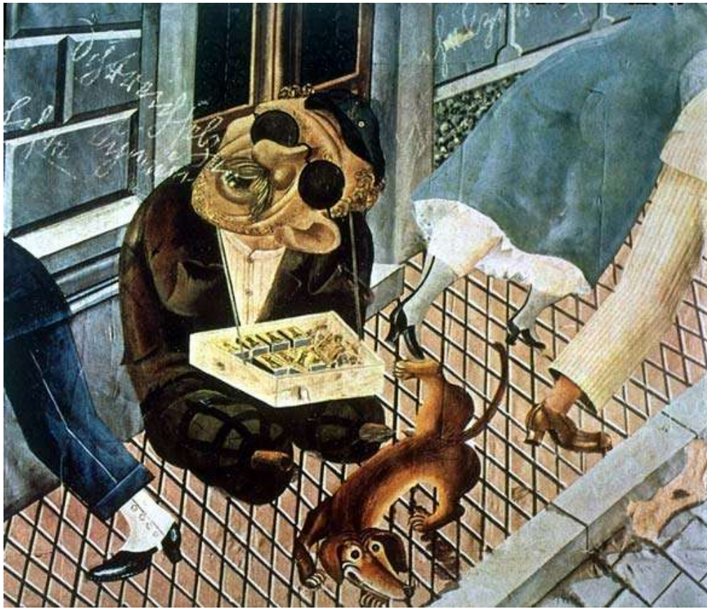
Otto Dix- 1921-The Match Seller