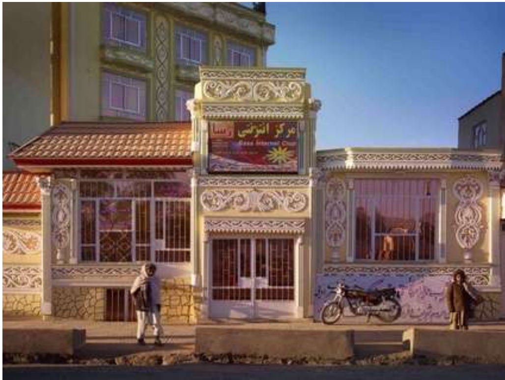
Simon Norfolk- Internet Cafe