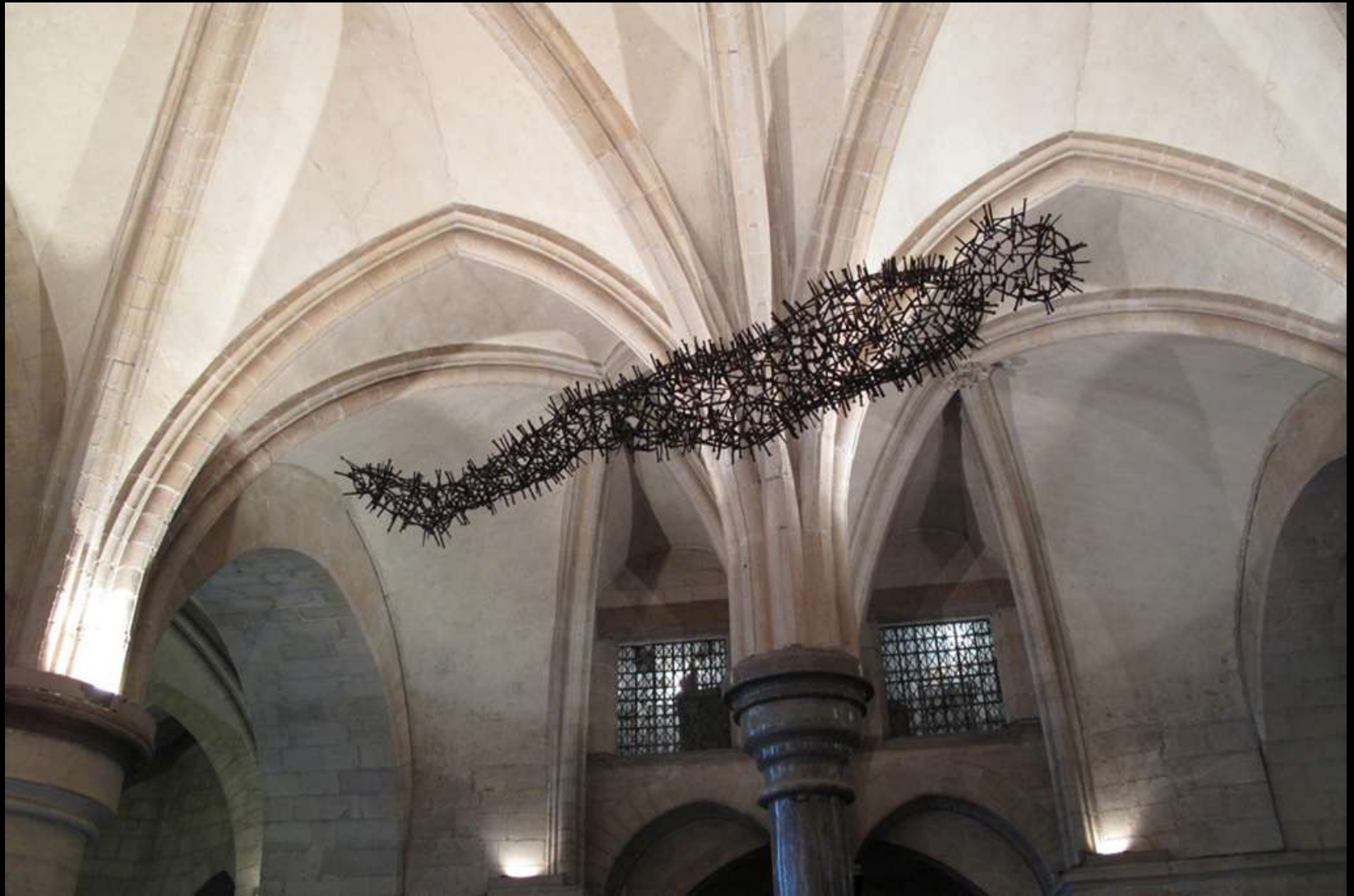
Gormley- Transport 2010