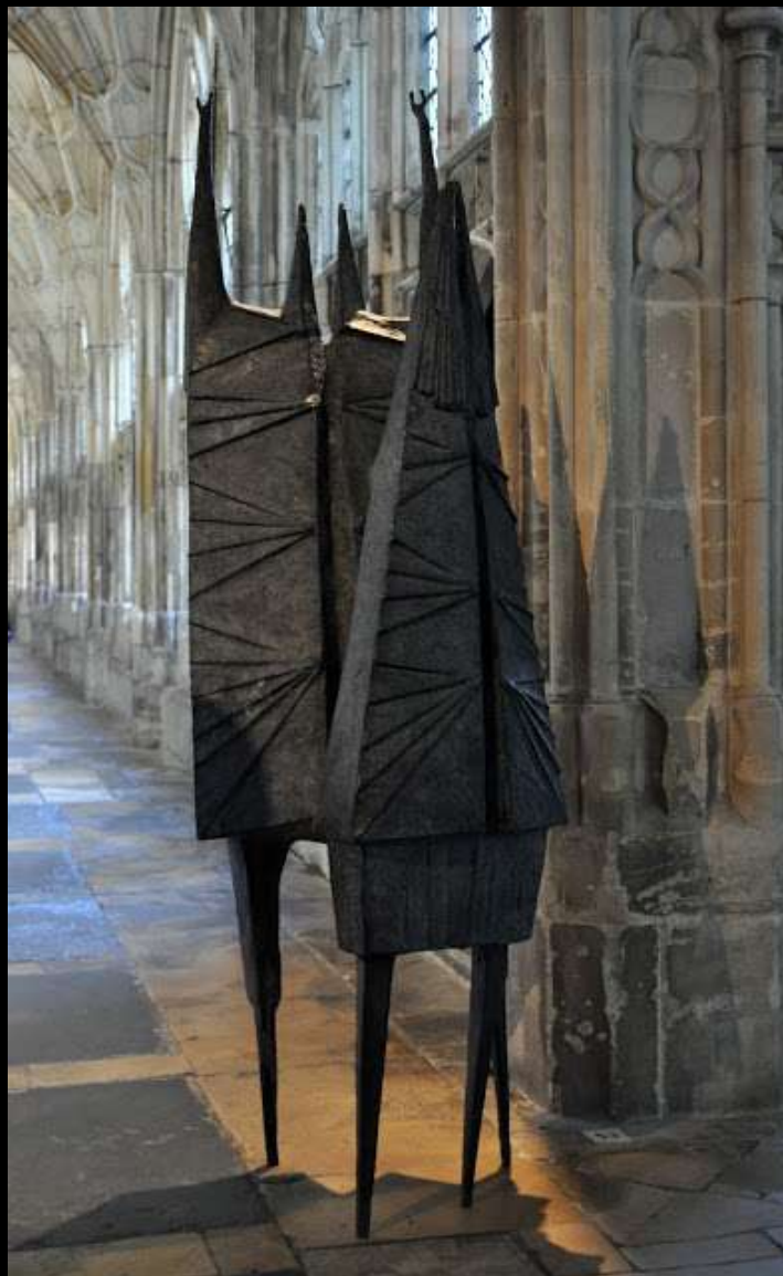
Chadwick- Teddy Boy and Girl-Gloucester Cathedral