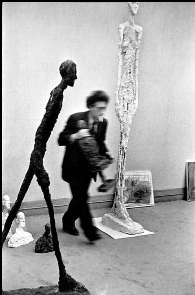
Giacometti in studio