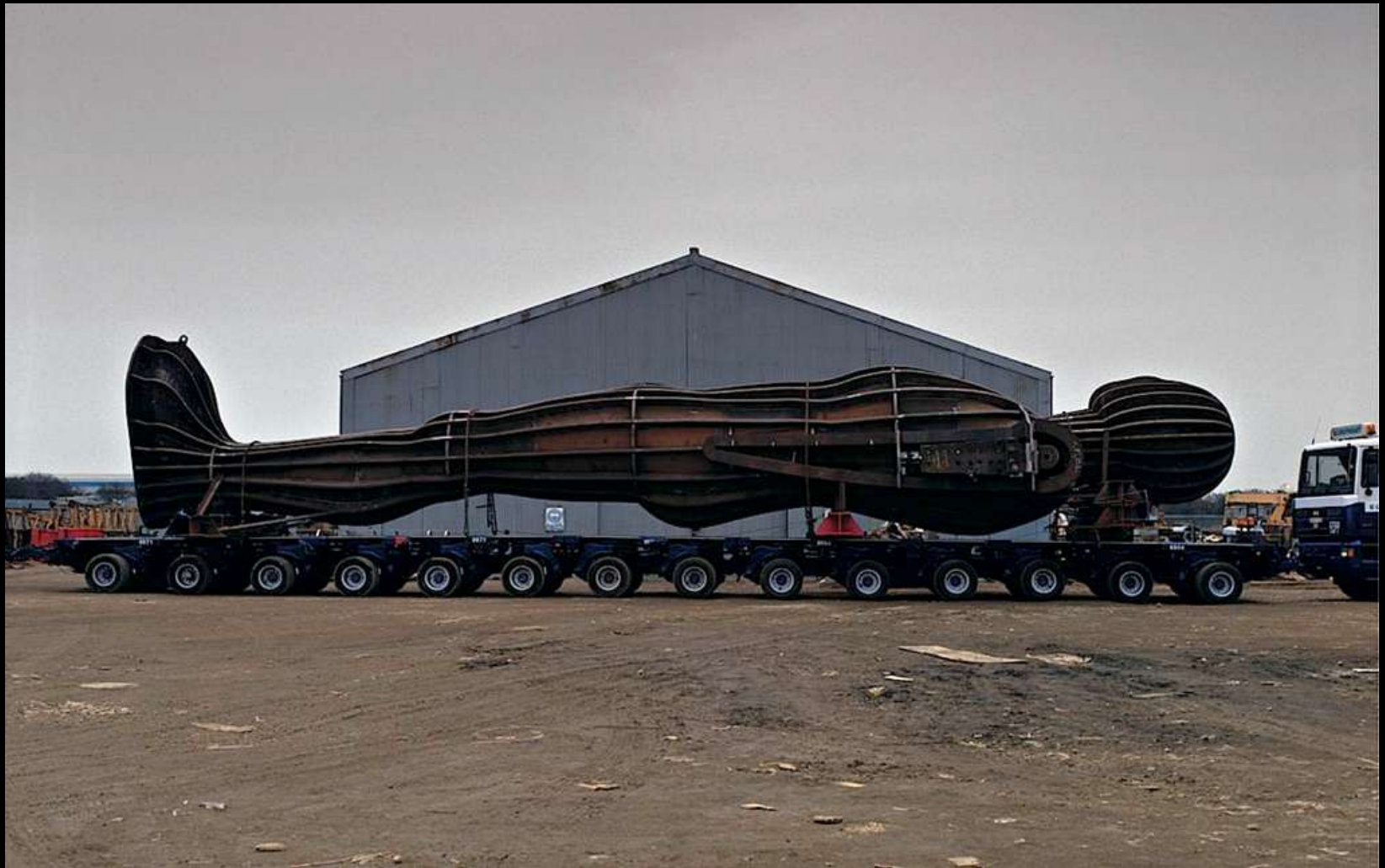
Transportation of mammoth sculpture from Gormley's workshop to site