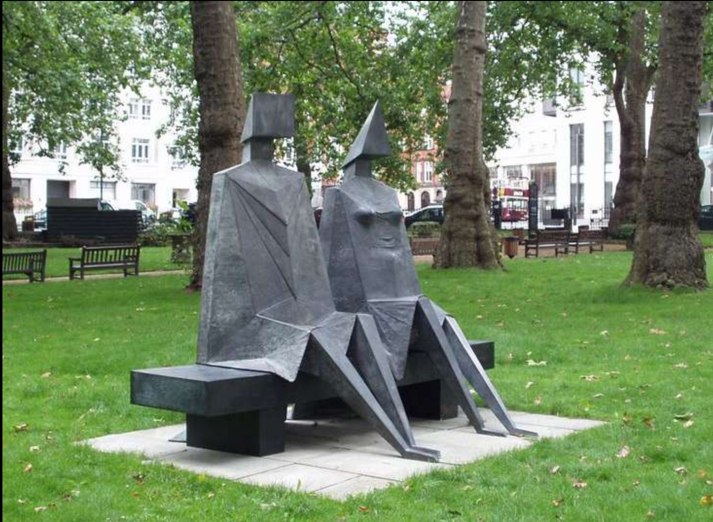
Lynn Chadwick - Sitting Couple, Berkeley Square - London