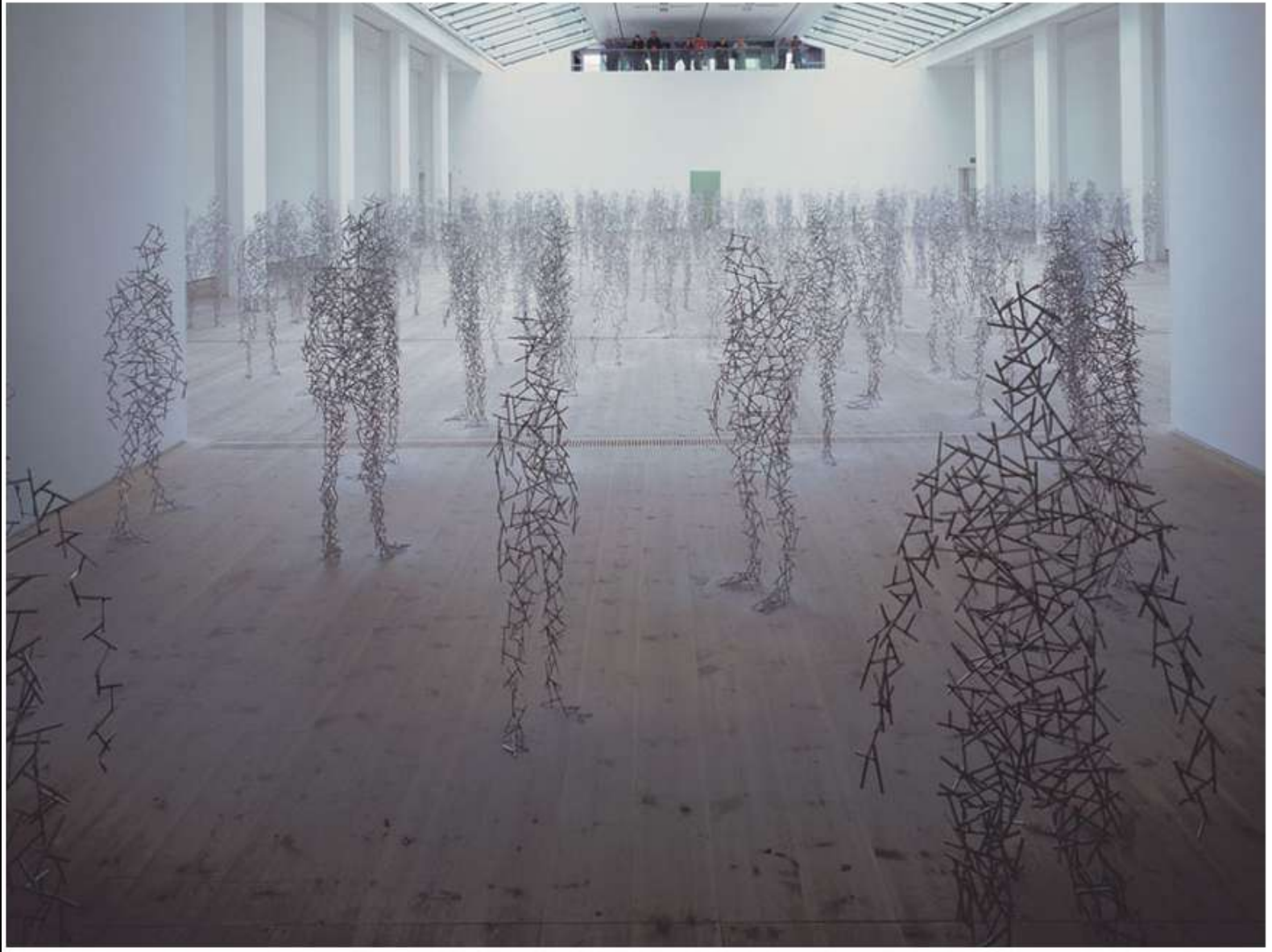
Gormley Domain field 2003