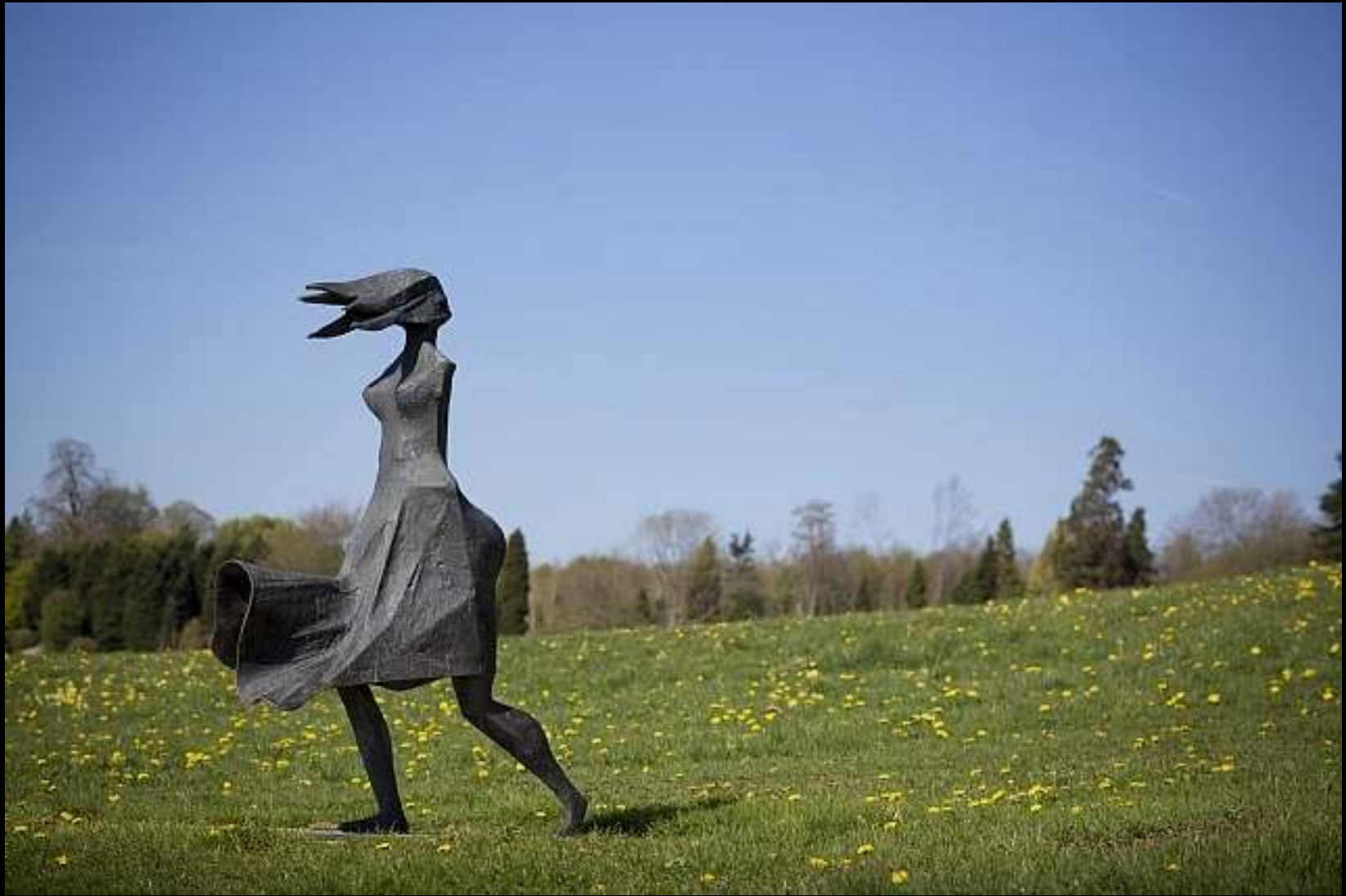
Chadwick, Lynn - High Wind IV- 1995