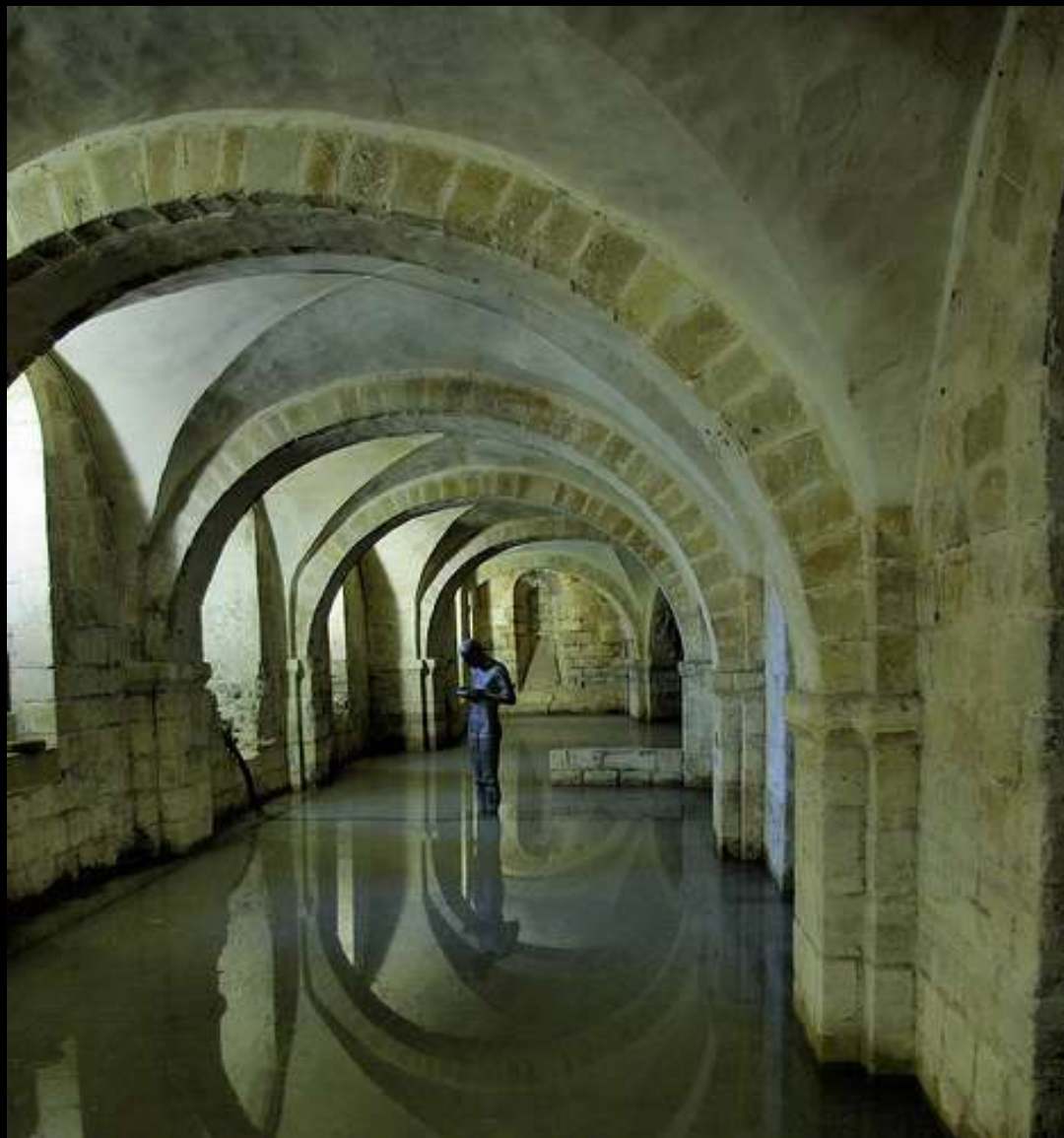
Gormley- Sound II Winchester Cathedral