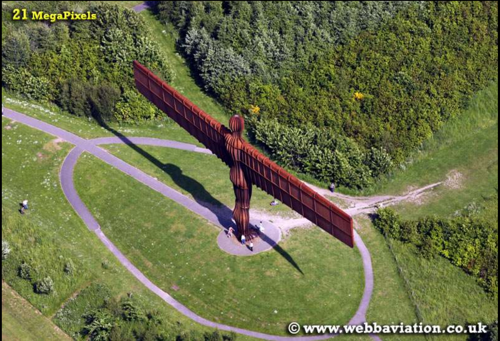
Aerial photo of Angel of the North in Gateshead