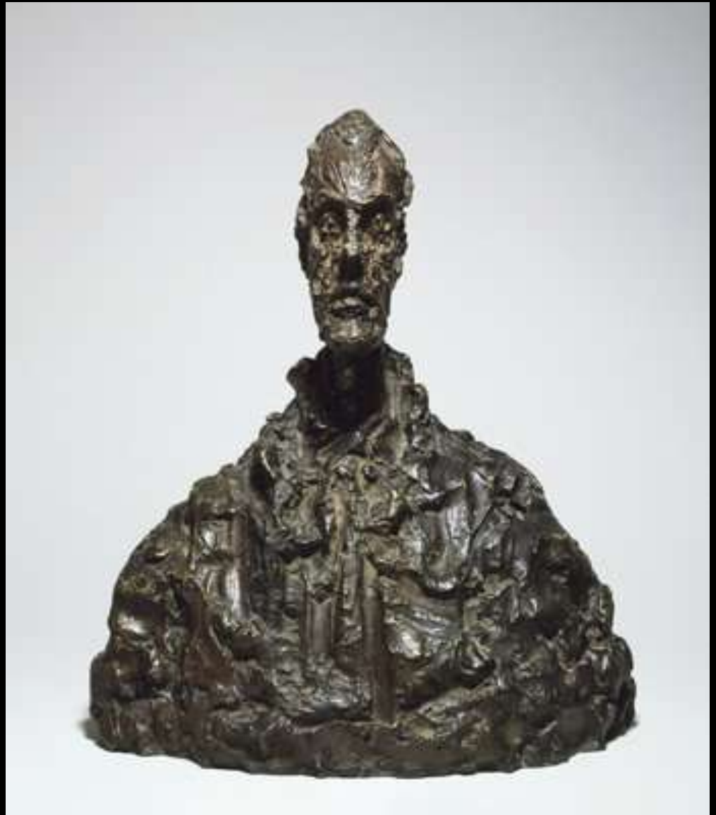
Diego by Alberto Giacometti

Alberto Giacometti 1901 – 1966 was a Swiss sculptor, painter, draughtsman, and printmaker. Giacometti was a key player in the Surrealist art movement, but his work resists easy categorization. Some describe it as formalist, others argue it is expressionist. While the intention of his sculpting was usually imitation, the end products were an expression of his emotional response to the subject. He attempted to create renditions of his models the way he saw them, and the way he thought they ought to be seen. He once said that he was sculpting not the human figure but "the shadow that is cast." Scholar William Barrett in Irrational Man: A Study in Existential Philosophy (1962), argues that the attenuated forms of Giacometti's figures reflect the view of 20th century modernism and existentialism that modern life is increasingly empty and devoid of meaning. "All the sculptures of today, like those of the past, will end one day in pieces... So it is important to fashion ones work carefully in its smallest recess and charge every particle of matter with life."