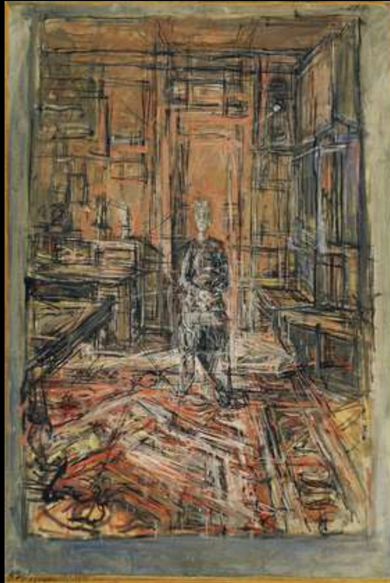
Giacometti- The artist's mother 1950