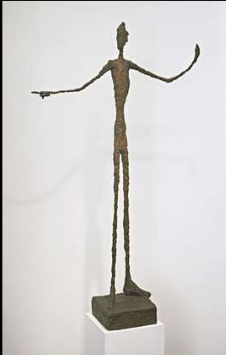
Giacometti- man pointing 1947