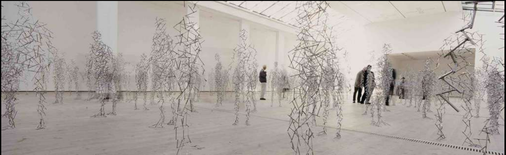
Gormley Domain field 2003

A DOMAIN is constructed of stainless steel bars of various lengths, with the finished installation including a collection of 287 sculptures. The work needs to be inhabited by the living bodies of the viewers (which in Gateshead included many of the friends and relatives of the participants). It is their motion through the piece that made the work.