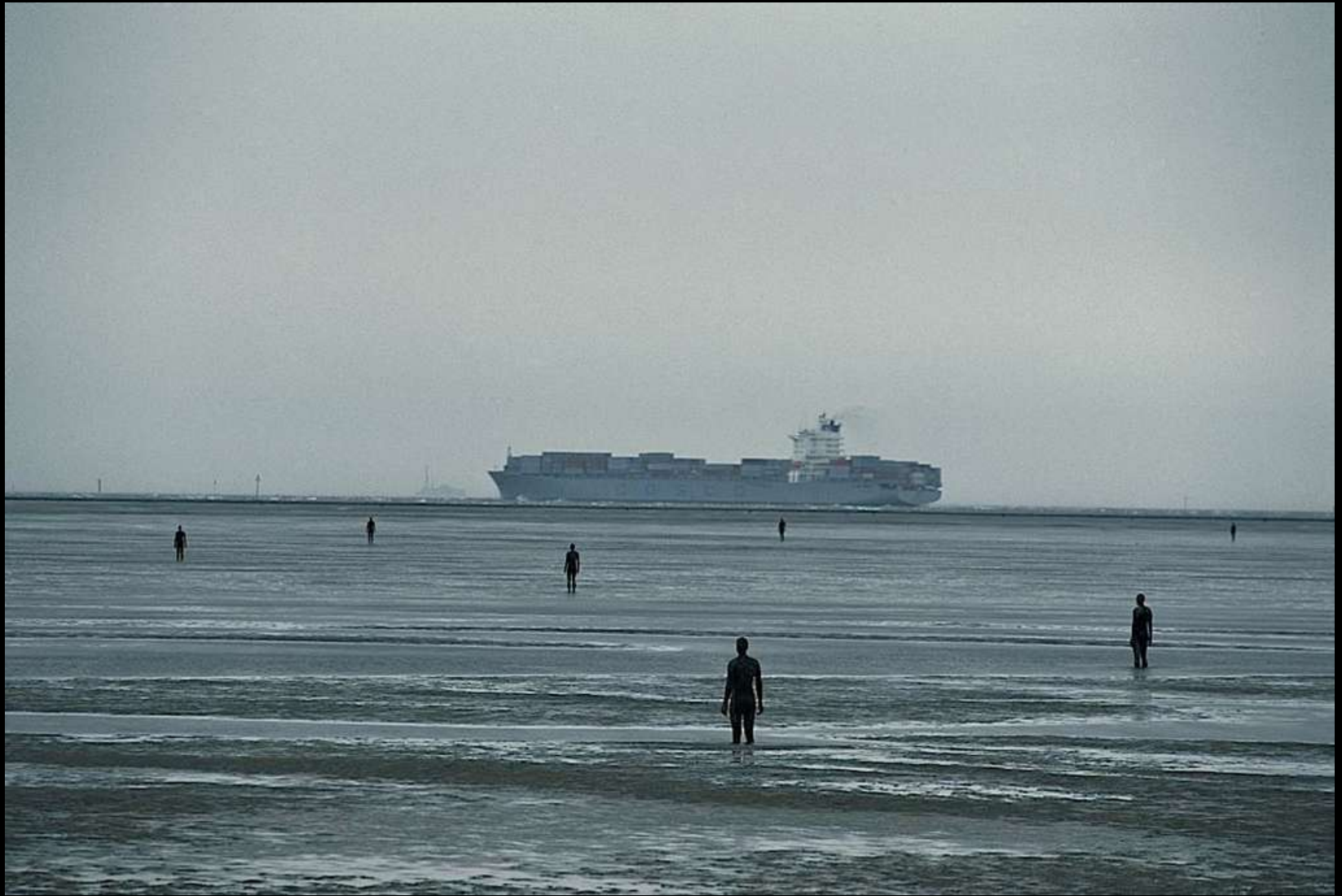
Gormley- Another Place-1997