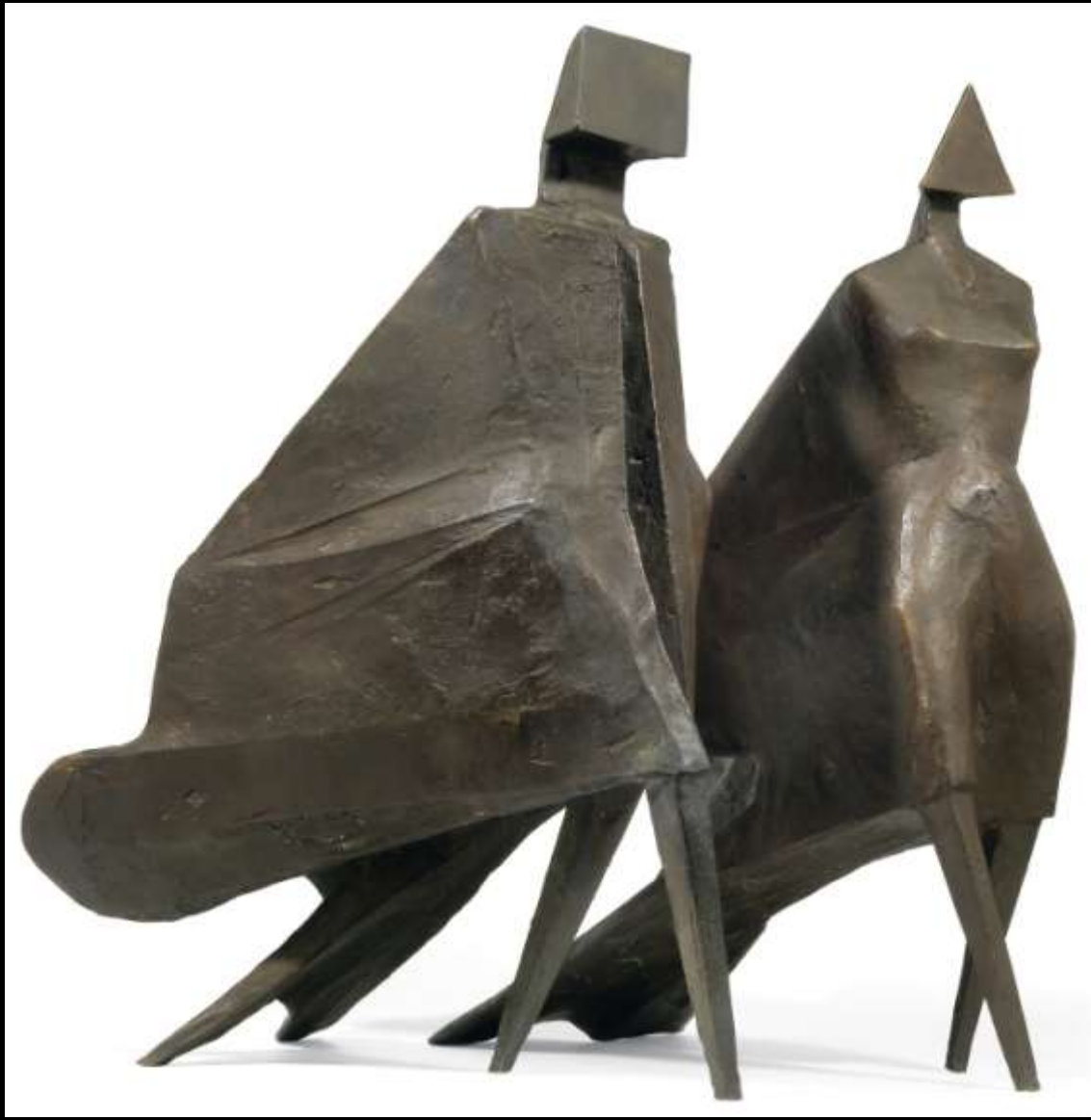
Chadwick, Lynn- Maquette III