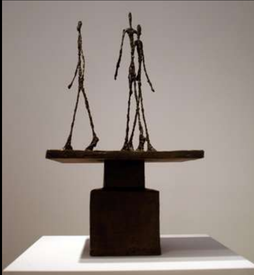
Giacometti group maquette sculpture