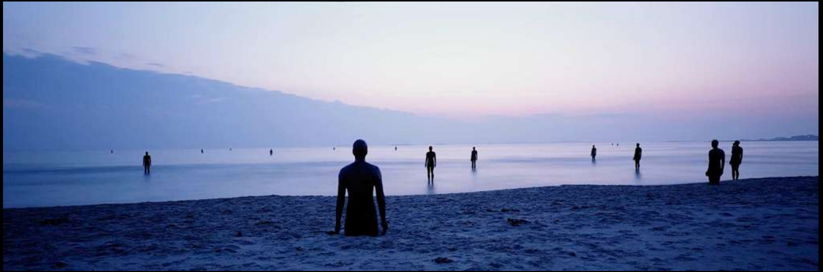
Gormley-Another Place- Crosby Beach- 1998