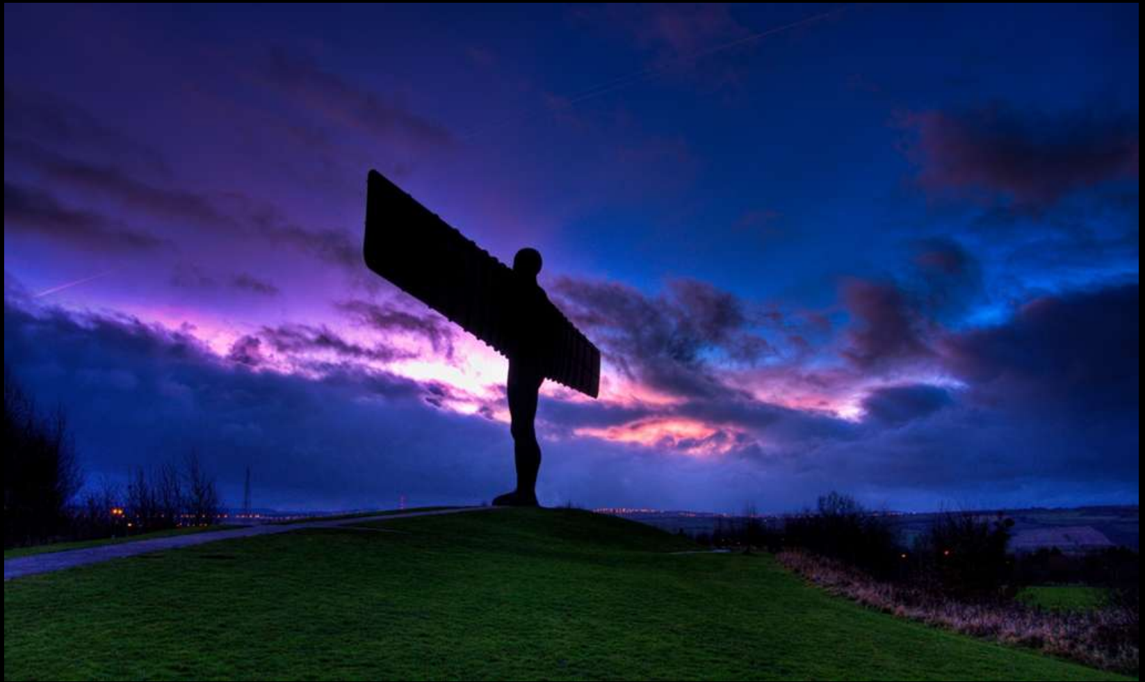
Angel of the North- Gormley