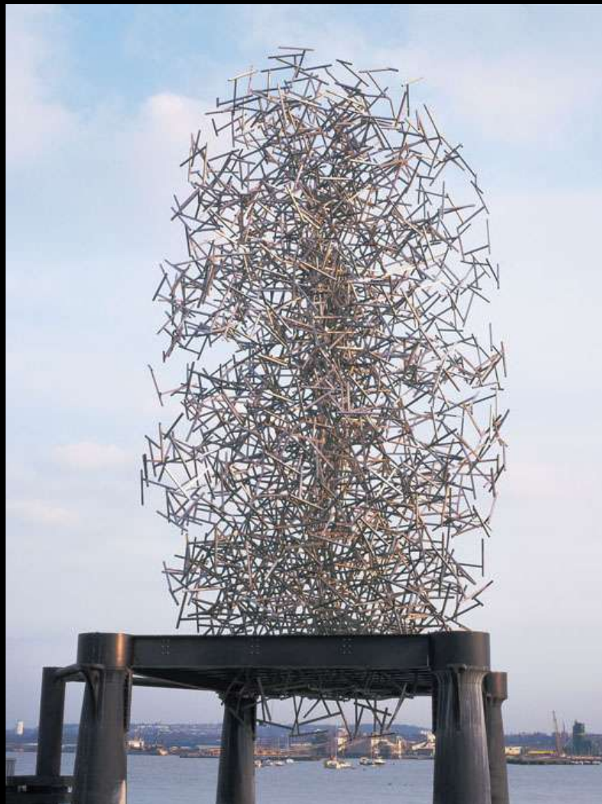
Gormley- quantum cloud 2000