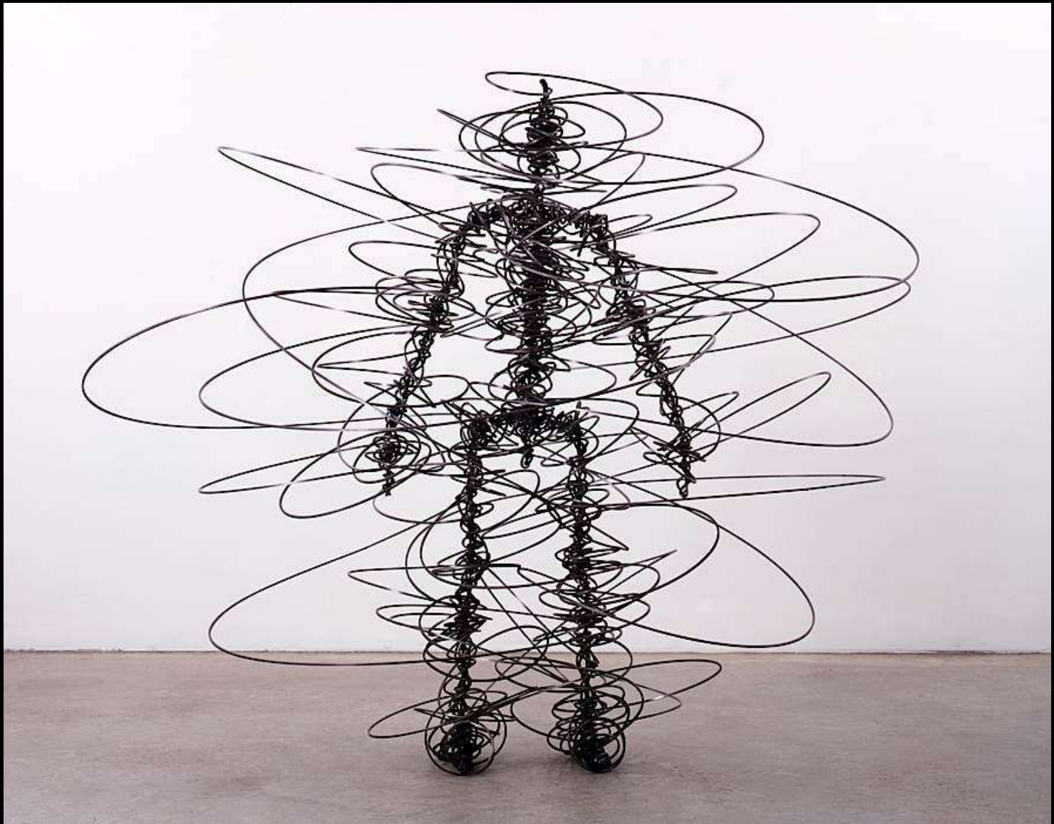
Gormley- feeling material_xxvi_2005