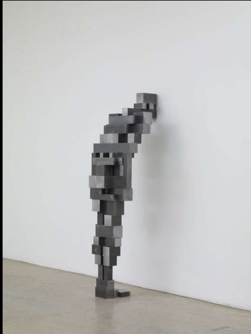
Gormley- Prop II 2012