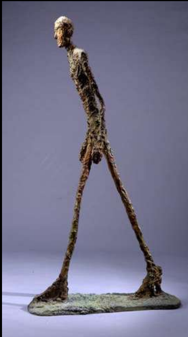
Giacometti - Walking-man - 1 of 6 1960