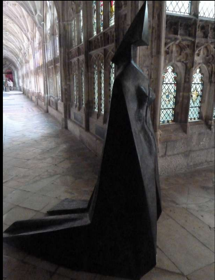
Chadwick- Cloaked Figure- Gloucester Cathedral