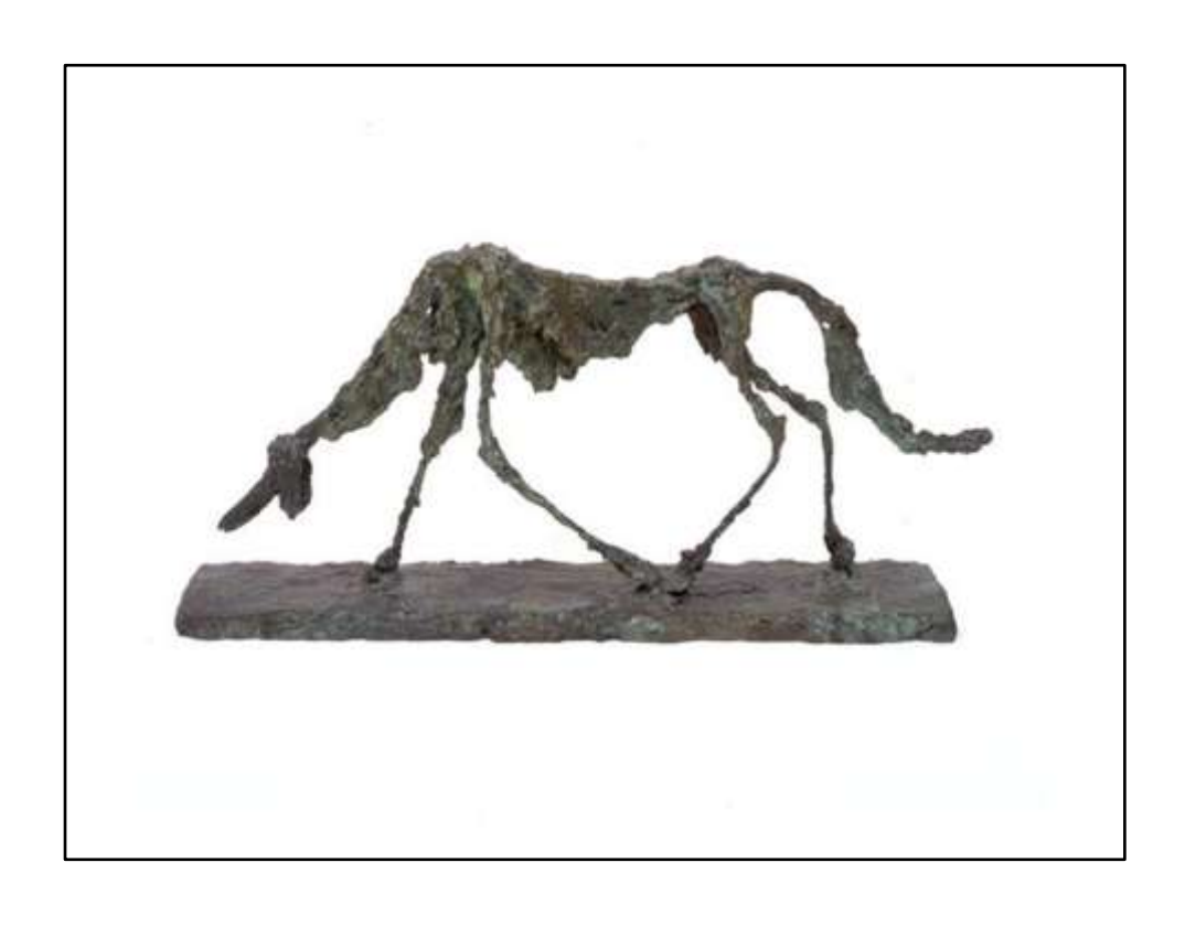
Swiss Artist Alberto Giacometti- Dog, 1951- Bronze cast sculpture