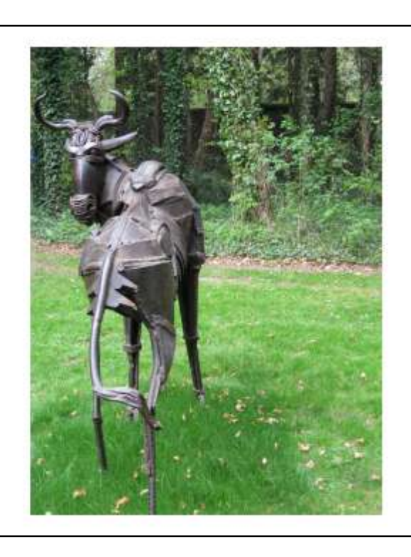
Sally Matthews- Gnu- 2001