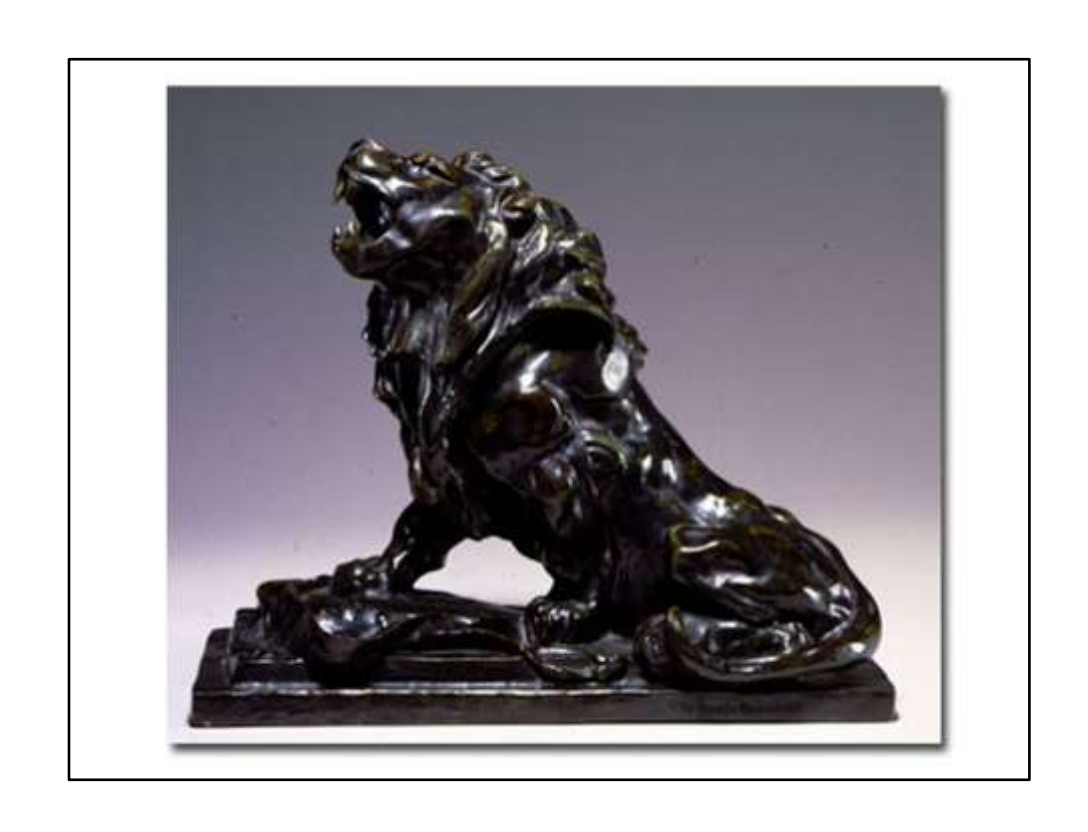
August Rodin- Le Lion qui Pleure- 1881