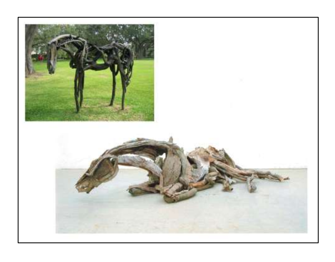
Deborah Butterfield- Horse in the Park, Habitat 2004-5