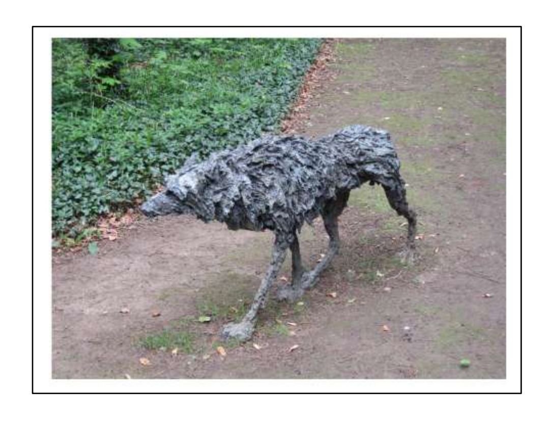
Sally matthews- Wolf 2001- Sculpture part of Permanent Public sculptures in Goodwood Sculpture Park